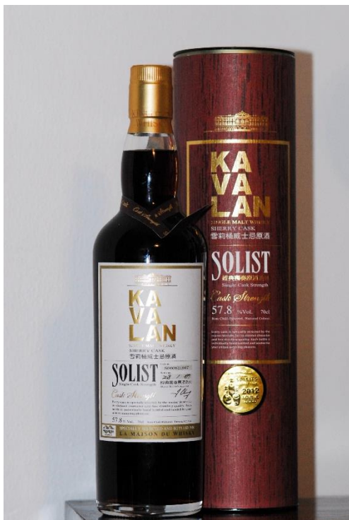
Kavalan Solist (OB for LMDW) Sherry cask No. S060821047, 57.8%