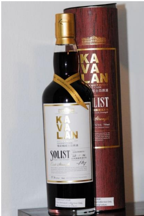
Kavalan Solist (OB) Sherry cask No. S060904031, 57.8%