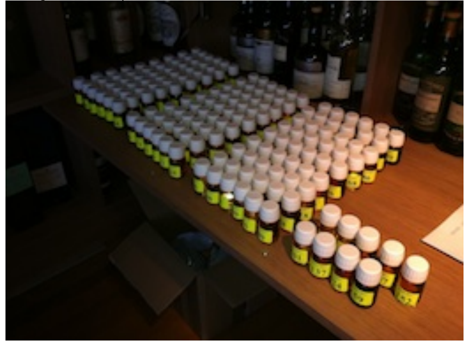
The flights are ready for round 1

I ended up with a number of flights, 29 in total, 27 with 6 samples in them, one flight of 4, and one of 5 samples, and very curious as to how the selection would turn out.