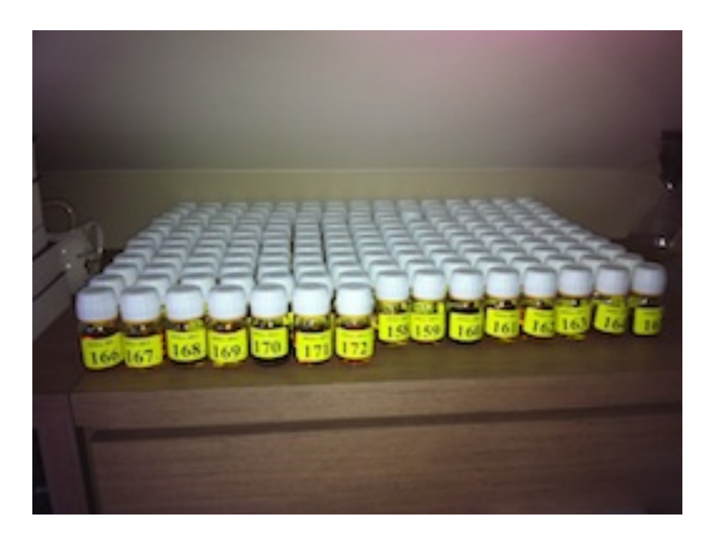
Finished...just leftovers now!

I was able to perform a decent amount of tasting work the weekend of November 12th...because November 11th is an official holiday in Belgium...so 3 days of uninterrupted tasting!