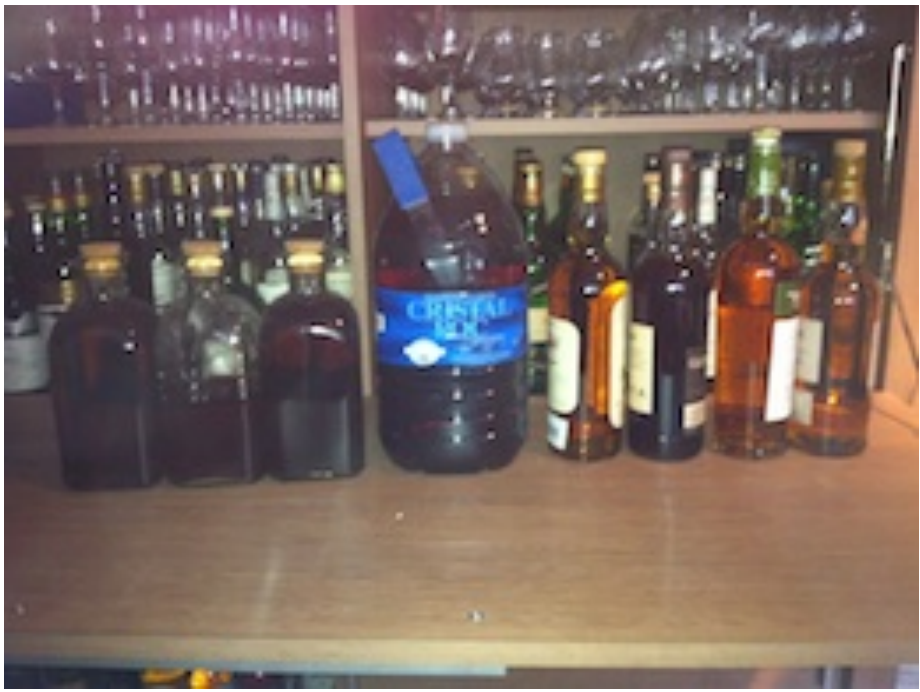
Blends I made from the leftovers (!) of MMA 2010 ...the jar in the middle is 3 liters!

Last year was a bit of an exceptional year. Around 260 samples had to be tasted, and no matter how maniacal we are, that stretched our collective livers to the point of bursting!