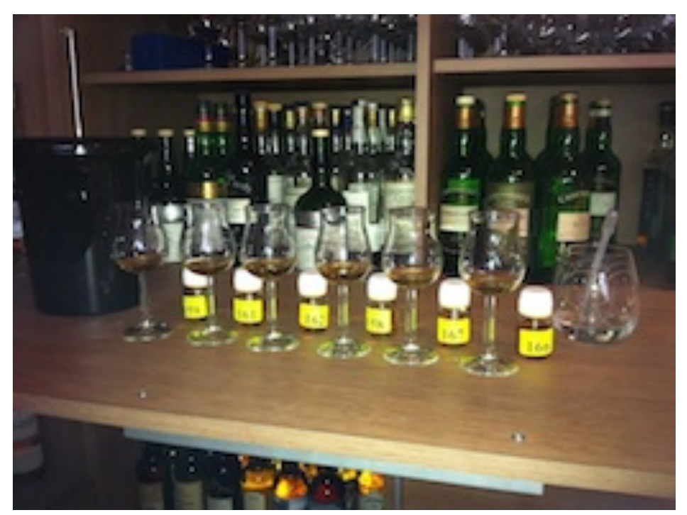
My setup: spitoon on the left, waterglas to the right, whisky in between.